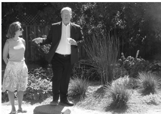
Pocket Park Celebration

New neighbors may not realize that our local pocket park, playground and the traffic-calming devices were the result of many hardworking neighbors getting together to create a more welcoming and family friendly community. Many of you worked hard to make these wonderful additions to our community a reality. We all benefit from the beautification work that has been done in our neighborhood over the last 20 years. It has mitigated traffic problems, raised our home values, offered places to play and, in general, improved the quality of life in our part of North Fair Oaks.