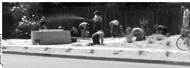
Weeding Day Party